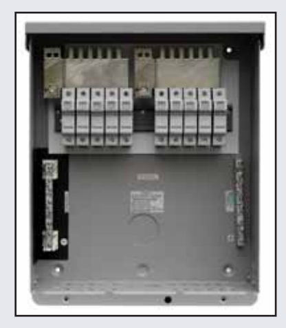
Configured for 600VDC Fuses (Gridtie)

Snap in adapters are included for use with fuse holders for a professional fit and finish. Breakers/fuse holders sold separately. Boxed size: 16 \times 14 \times 5 Weight: 8 Lbs.